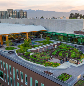
University of British Columbia