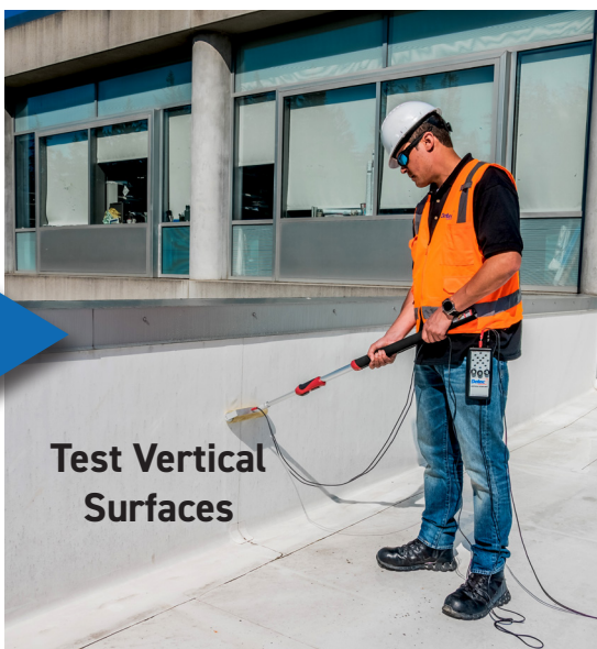
Test Vertical Surfaces