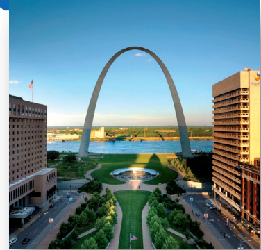
Museum of Westward Expansion St. Louis