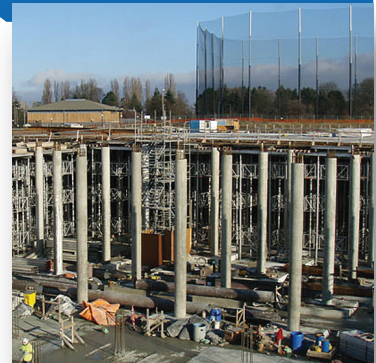
Beacon Hill Reservoir Seattle