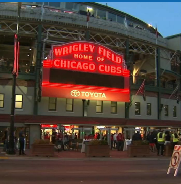
Wrigley Field Chicago