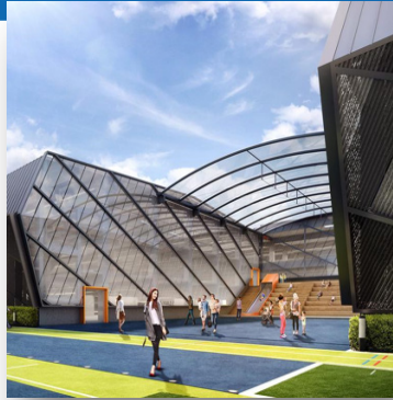
Nike HQ Beaverton