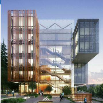
University of Washington