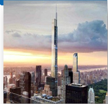
Nordstrom Tower New York